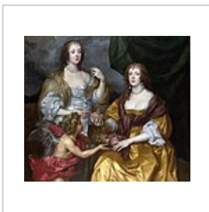
Lady Elizabeth Thimbelby and her Sister, Anthony van Dyck